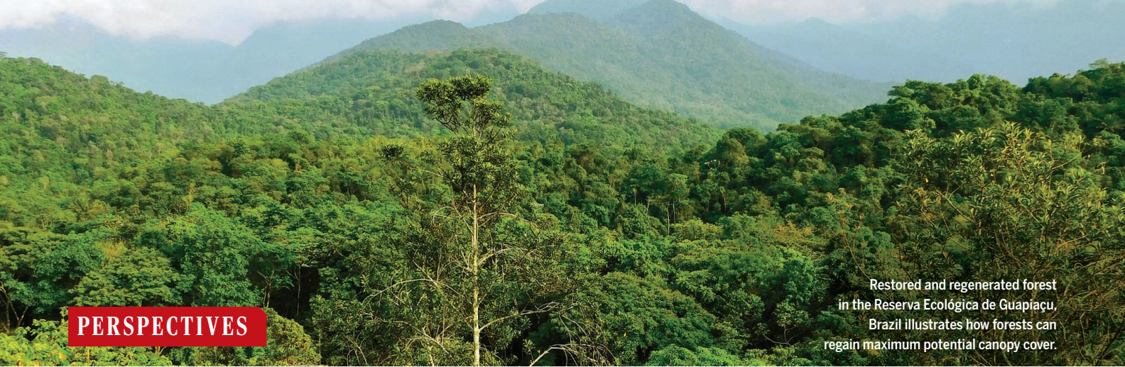
Restored and regenerated forest in the Reserva Ecológica de Guapiáçu, Brazil illustrates how forests can regain maximum potential canopy cover.